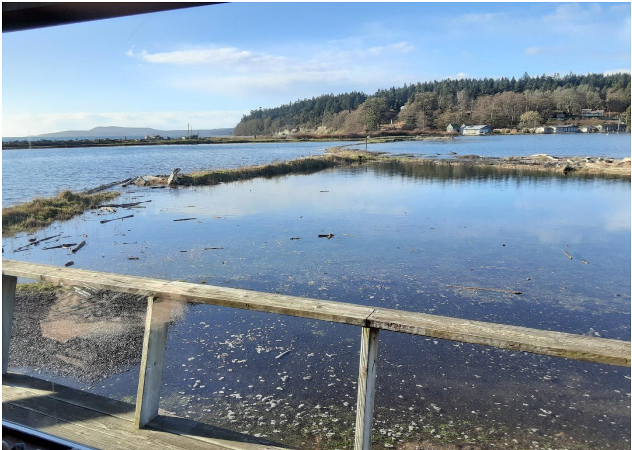
Break through from the lagoon to our “pond”. The mallards like it.

Replacing the well created a large monthly savings. When we left in 2020 the electric bill for the pump house was around $80 per month. Before we replaced the well this May, the monthly charges were around $385. That's how much the well casing had degraded in such a short time!