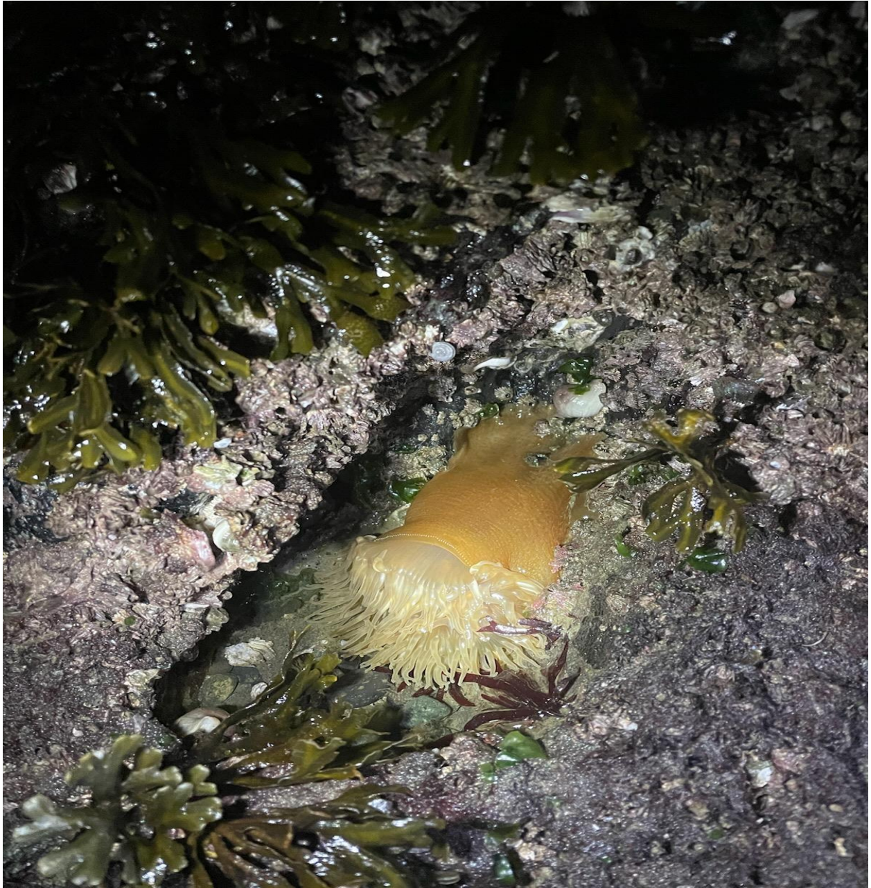
A sea anemone just waiting for the tide to return.

In early December my niece visited with a friend. On a new moon night, with a minus tide they went around the head with flashlights. The next three pictures are what they found.