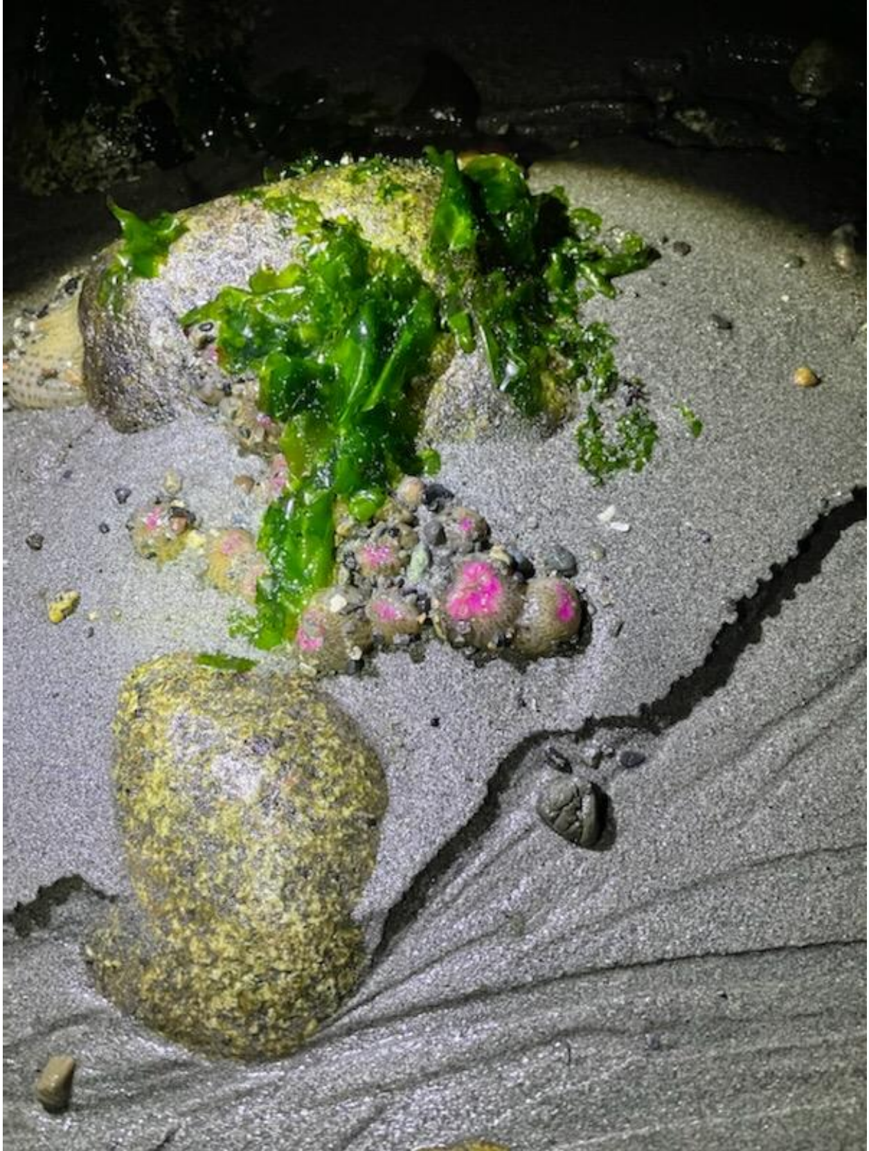
Closed pink anemones