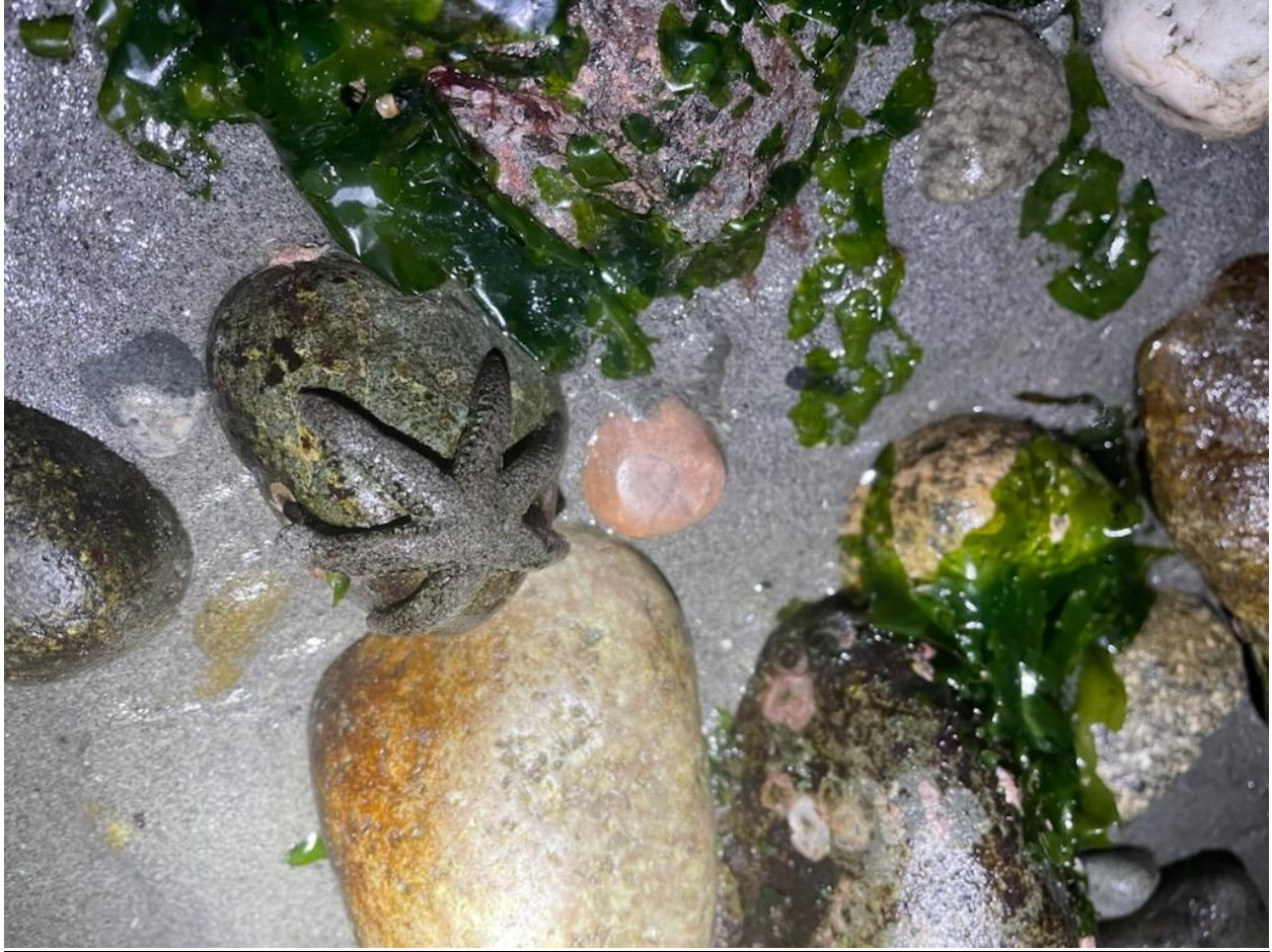
A large gray starfish (now called sea star)