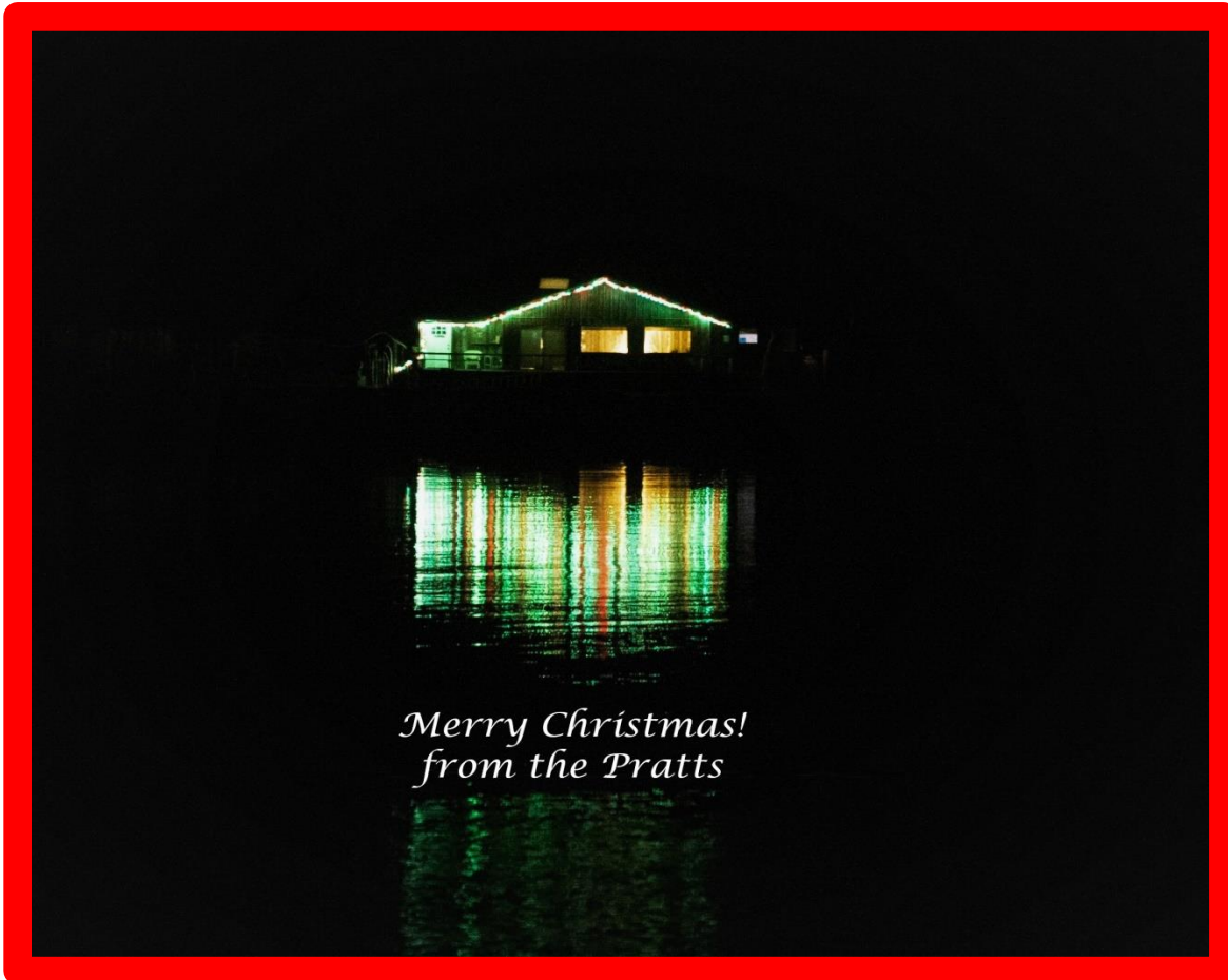
taken Thanksgiving Holiday at DHBA