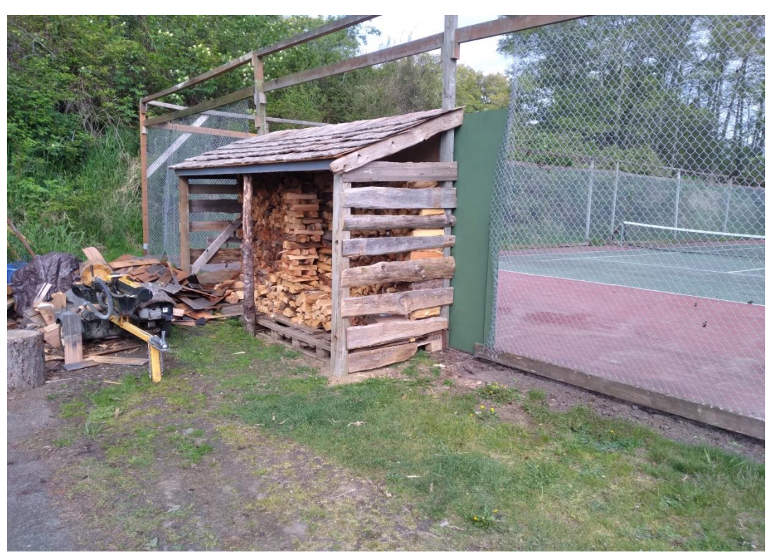
New firewood storage shed and support for backboard

The tennis court will be resurfaced in late May, early June.