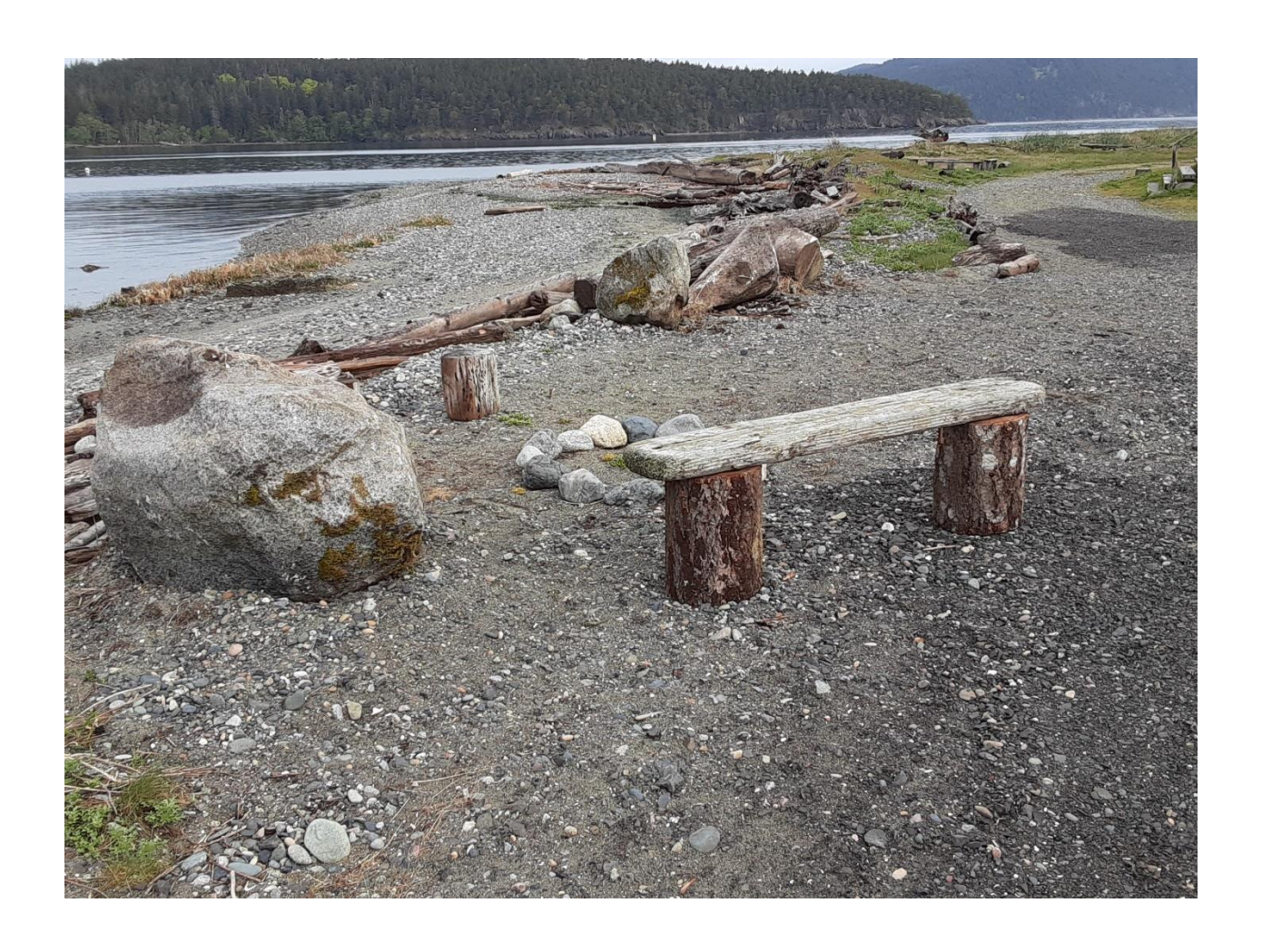
New firepit in front of cabin #5. Gravel spread out and large boulders in place to fill in as we rebuild this berm.