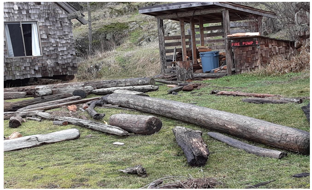
Logs left behind after January flooding-between cabin 5 and 6