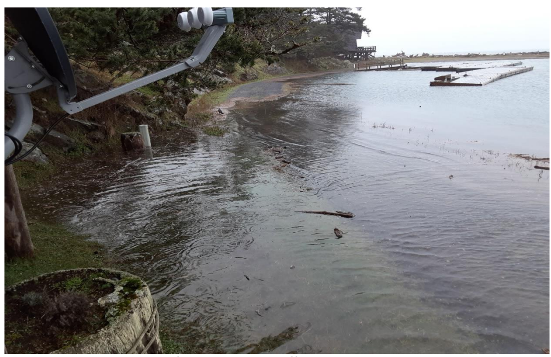
January flooding under office and lagoon drive