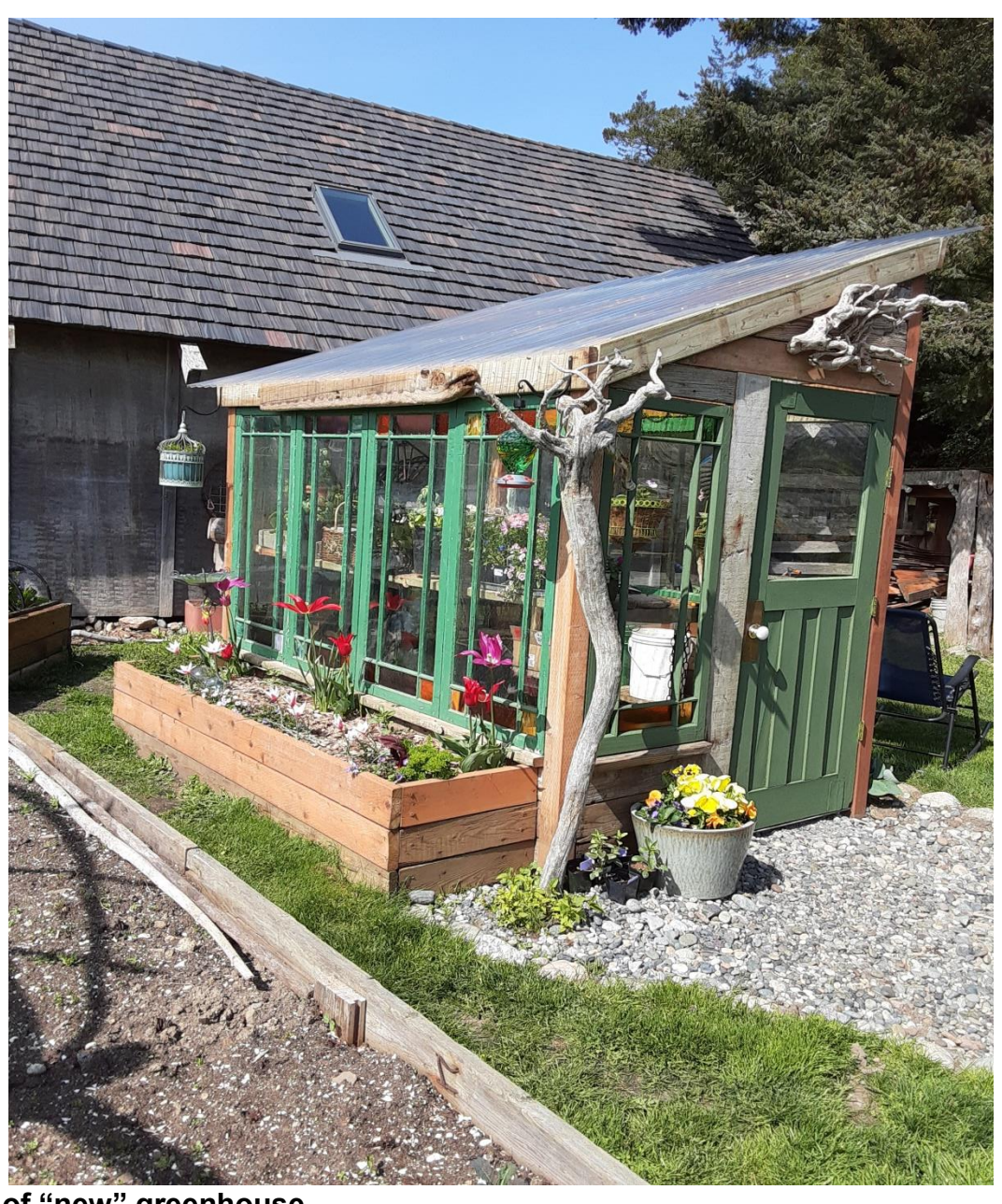
Front of "new" greenhouse