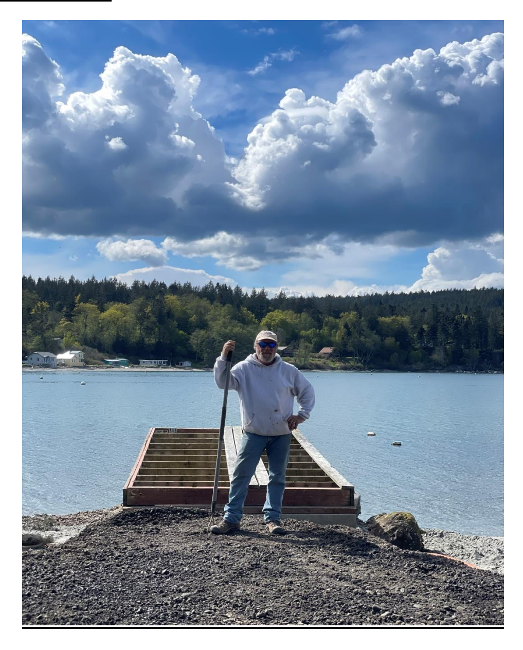
Maintenance Man!

The dock is back in and ready! Seth rebuilt the land based portion along with two new concrete footers for support. Then gravel was spread, rocks were laid and we have the start to the rebuilding of this area. We have been moving large boulders (with the help from a friend with a backhoe) into place along the drive in front of cabin 5. This is an ongoing effort as we add more boulders and smaller rocks. Then some gravel, topsoil and then plugs of the grasses that grow naturally along the berms in front of cabin 7 and 8. Building up this area will help with the flooding each winter.