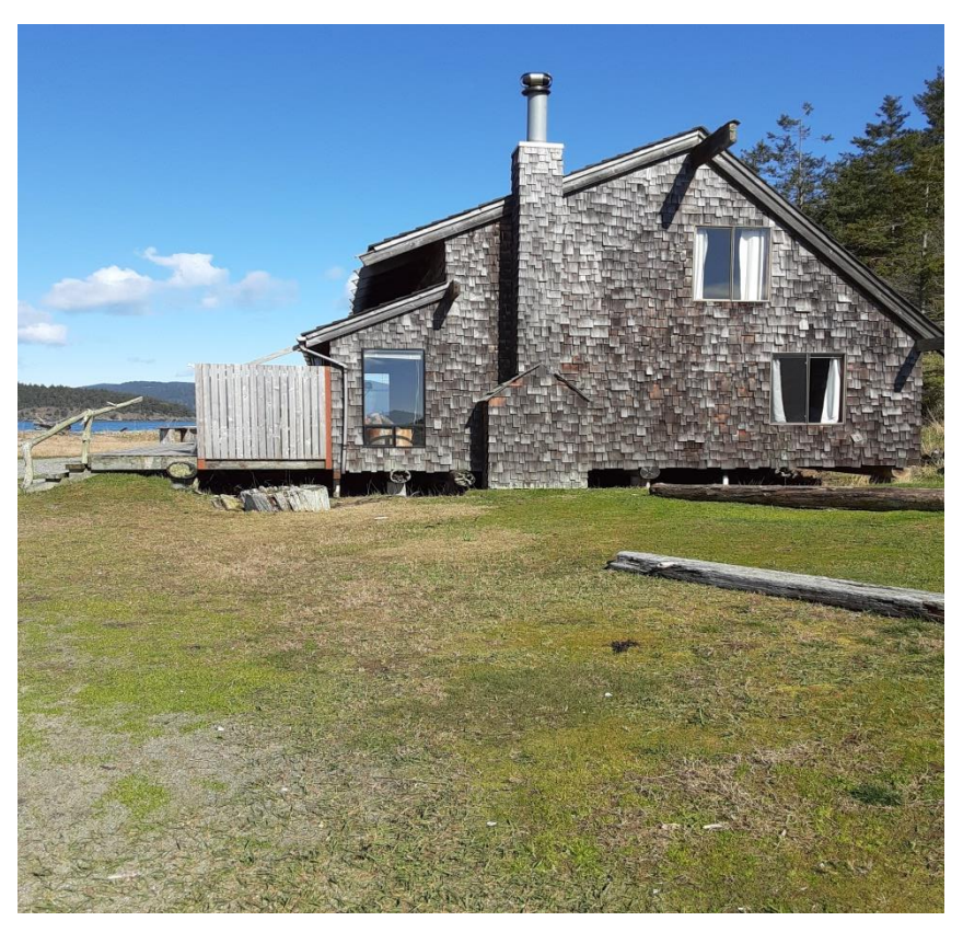
After clean-up. Large logs were removed with backhoe a few weeks ago