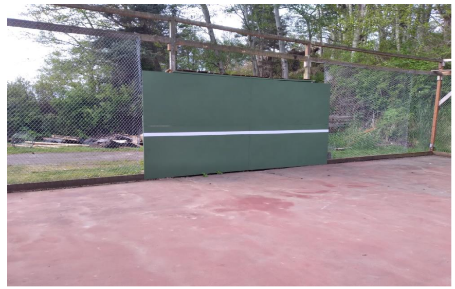
New backboard for tennis practice