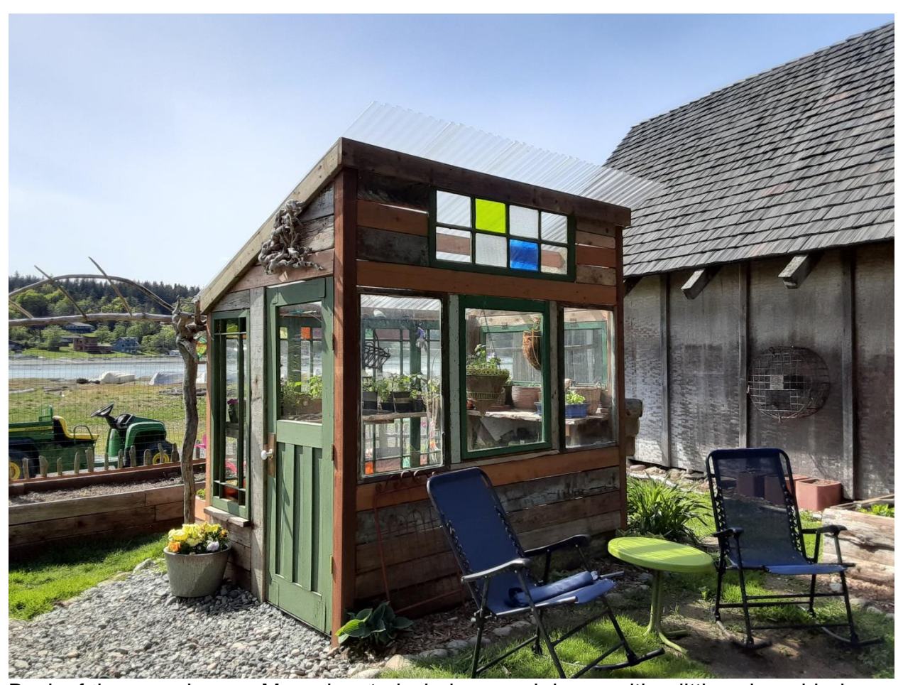
Back of the greenhouse. More donated windows and door...with a little color added

Spring surely is a welcome sight here at Decatur Head! On our cover is the greenhouse we built this spring! See below for more pictures. We have built more vegetable beds for plenty to share. Swiss chard, broccoli, kale, beans, snow peas, parsley, basil, chives, oregano, thyme and rosemary should be plentiful. Even a new type of container corn! Most of this build was reclaimed lumber and old windows given to us by neighbors.