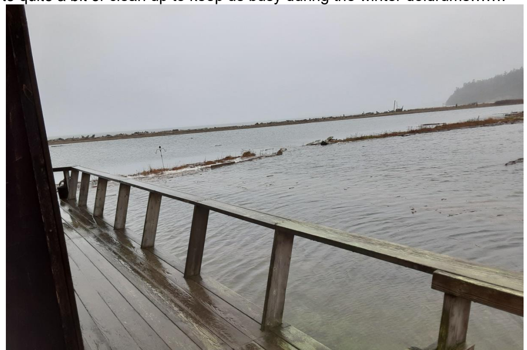
Caretaker porch January flooding