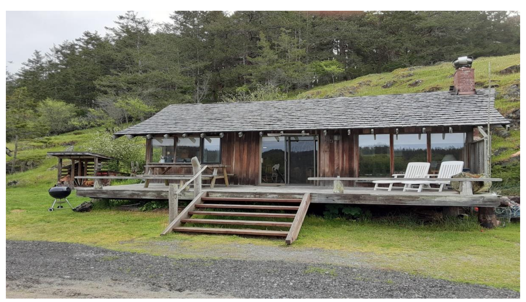
Front complete. Back to be completed in the Fall

For a more detailed description of maintenance completed please visit this link on our webpage. <a href="https://www.decaturhead.org/updatesfaqs/">https://www.decaturhead.org/updatesfaqs/</a>