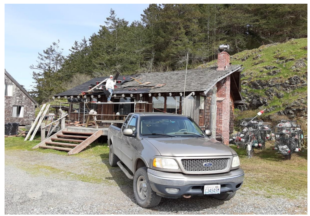
Maintenance Man at work again. Work in progress.